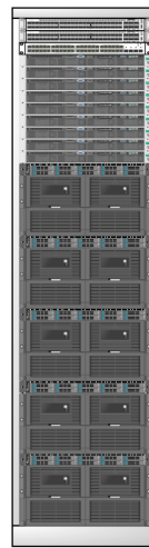
Figure 3: Storage rack config

The design shown in this section builds on the first reference design shown above, to show what a full rack might look like. In this architecture, the aim is to achieve the highest density for servers by using the HPE ProLiant or Apollo rack or blade servers, HPE JBOD with high bandwidth HPE networking and storage. The design also takes into consideration the optimal ratio of drives to servers and the bandwidth to each drive, to build out a rack-level configuration that is optimized for the typical big data workloads. Scaling is achieved by simply replicating this rack-level configuration. Customers have the flexibility to spread the 350 drives across the 9 nodes. Customers can work with DriveScale Solution Architects to optimally grow the rack and cluster.