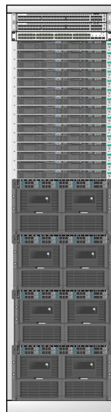
Figure 2: Full rack config

The design shown in this section builds on the first reference design shown above, to show what a full rack might look like. In this architecture, the aim is to achieve the highest density for servers by using the HPE ProLiant or Apollo rack or blade servers, HPE JBOD with high bandwidth HPE networking and storage. The design also takes into consideration the optimal ratio of drives to servers and the bandwidth to each drive, to build out a rack-level configuration that is optimized for the typical big data workloads. Scaling is achieved by simply replicating this rack-level configuration. Customers have the flexibility to spread the 280 drives across the 15 nodes or add more nodes to be used with the existing 280 drives or have less than 15 nodes with 280 drives in the JBOD. Customers can work with DriveScale Solution Architects to optimally grow the rack and cluster.